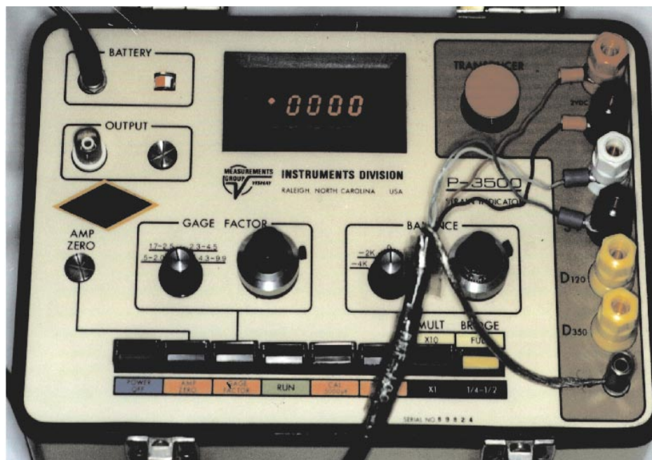
Figure 2 Digital strain indicator.